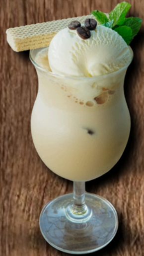
*Vanilla Coffee Milkshake

Kopi, susu segar dan es krim vanilla. Coffee, fresh milk and vanilla ice cream.