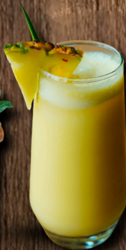
*Virgin Pina Colada

All prices are in Indonesian Rupiah and are subject to 21% service charge and government tax.